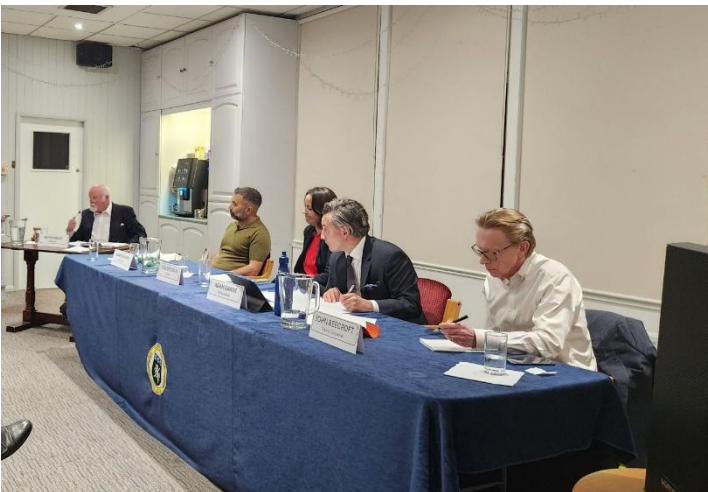
Local democracy in action

RVR is covered by three Bromley wards (Beckenham Town, Shortlands & Park Langley; and Beckenham Town & Copers Cope) and one in Lewisham (Downham).