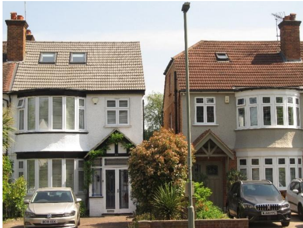
100 Ravensbourne Avenue where the Council is requiring the roof to be adjusted to match 98 Ravensbourne Avenue.

In Shortlands Village, traders on Beckenham Lane regularly get caught out by complex planning rules, made more complex by being in a Conservation Area. In essence, if any change to a shop can be seen from the road, there is potential for difficulties with planning rules. To help traders we have a special section on the RVR website detailing common issues.