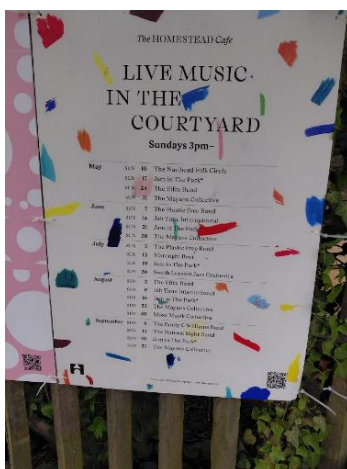
Poster at BPP entrance

Although there is a website for BPP it has not been updated at time of writing. One of the best ways of finding out what is going on is often through notices on the railings, for example at the Crab Hill entrance opposite Ravensbourne Station where the various markets and events are often advertised. One example is Jam in the Park every third Sunday at 3pm in the Homestead Café courtyard from May until September for a lively, open-stage music experience. Also see the Mansion House website for events and activities. Other events this summer include the Taste of the Caribbean food festival on Saturday 4 th and Sunday 5 th July.