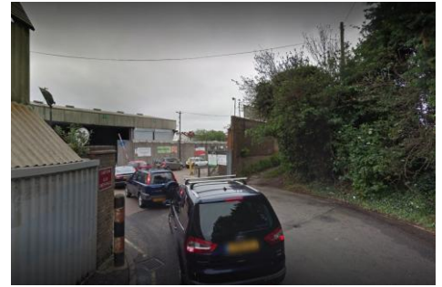
Waldo Road recycling centre

Churchfields Waste Centre remains open but booking is essential.