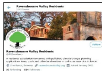
RVR X page